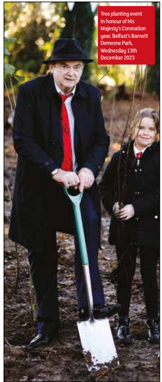
Tree planting event in honour of His Majesty's Coronation year, Belfast's Barnett Demesne Park, Wednesday 13th December 2023

They have made so many great friends along the way. From the individual customers who call them daily, telling their own success stories, to well-known personalities. From the 'Horse Whisperer,' to the 'Supervet,' from Rory Bremner to Zara Tindall and onwards to Love