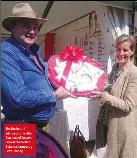
The Duchess of Edinburgh, then the Countess of Wessex, is presented with a Botanica hamper by Sean Cooney

the way they've picked up thousands of loyal customers and distributors in every part of the world. They now operate out of a custom ISO approved facility in Warrenpoint with offices, meeting rooms and a production area fit to meet the growing global demand for Botanica products.